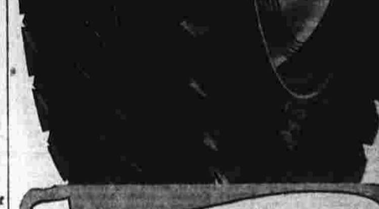
Portrait of a woman